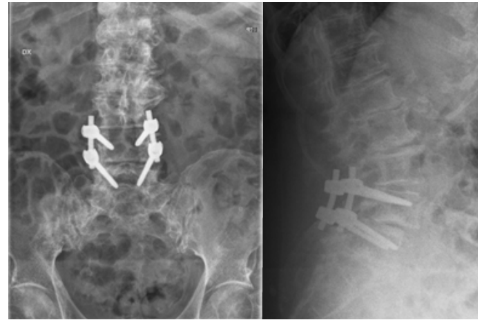
Figure 3: X-ray image in and in anterior-posterior (a) and lateral (a) position on the second postoperative day after onelevel L4/5 fusion surgery and laminectomy.

extubated in 15 minutes after the end of surgery. The patient awoke absolutely pain-free (NRS 0-1) and without nausea. She presented slightly confused in the first 20 minutes after the surgery but was able to communicate properly and convincingly controlling her airways.