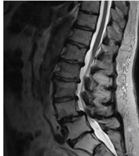
Figure 1: Magnetic resonance image in lateral position.

spondylolisthesis and L4-L5 stenosis as seen in figure 1.